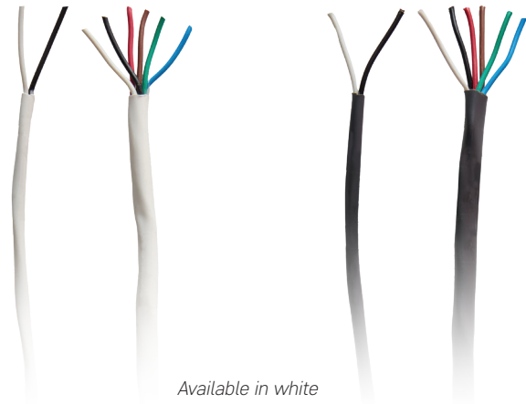
Available in white and charcoal grey.

The LOGISON® mark is printed on the jacket for easy identification on site. However, other code compliant cables can be used, providing they meet the LogiSon requirements.